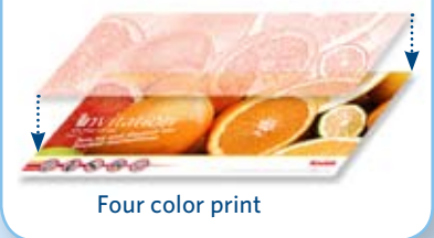
Dimensional Dry Ink

Like all NexPress Fifth Imaging Unit Solutions, Dimensional Coating creates prints that are recyclable. Dimensional Coating does not require any special de-inking and uses no volatile organic compounds (VOCs) so you can produce prints that drive more profit per page and is still safe for our environment.