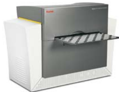
Kodak Magnus 400 II Platesetter, semi-automatic base engine