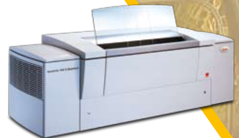
Kodak Trendsetter 400 III Quantum Platesetter, semiautomatic base engine

With the Trendsetter 400 III Quantum Platesetter, you'll realize the extraordinary benefits of Kodak SQUARESPOT Imaging Technology, process control and 20-micron and optional 10-micron Staccato Screening.